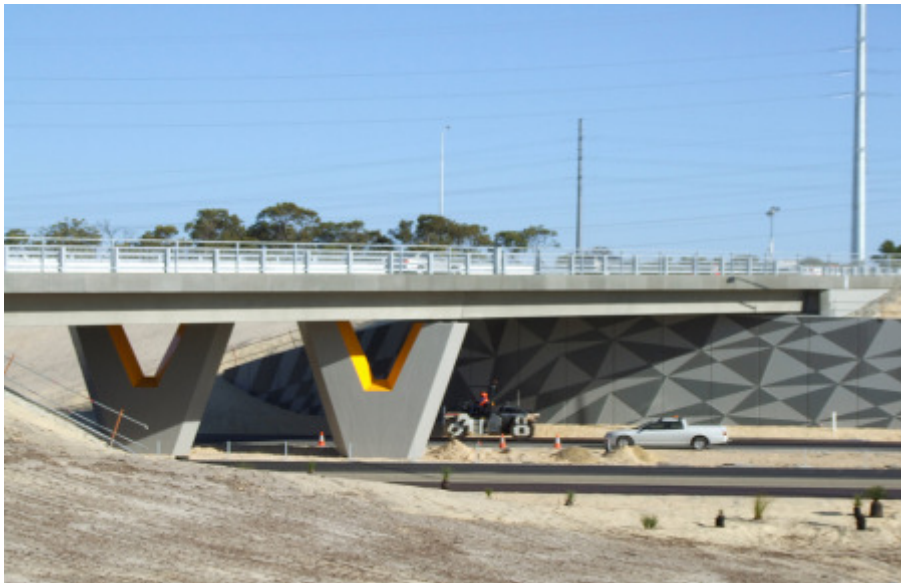
Roe Highway – Stage 7