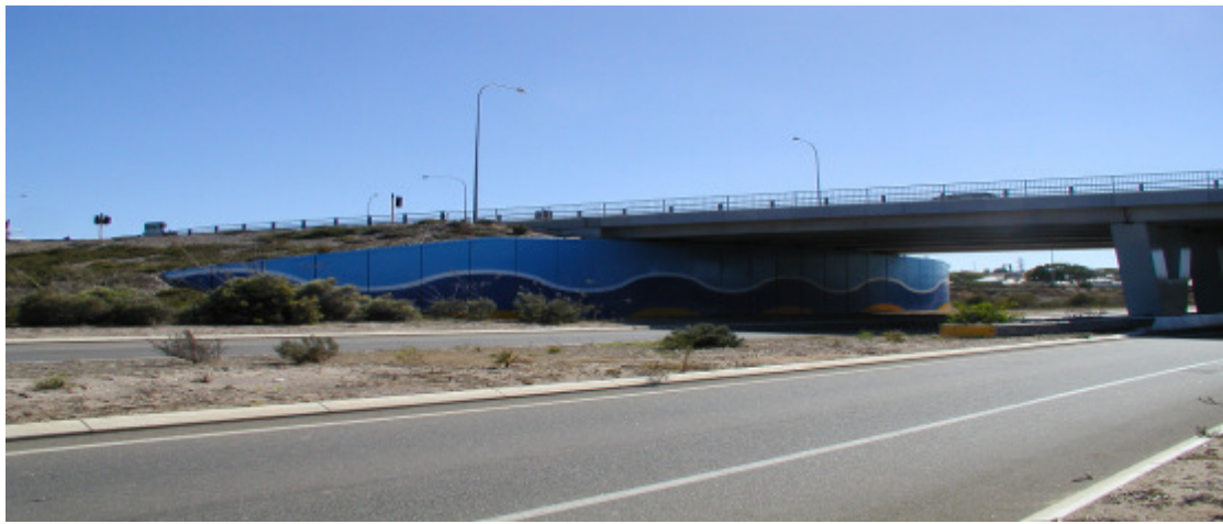
Geraldton Highway Abutments