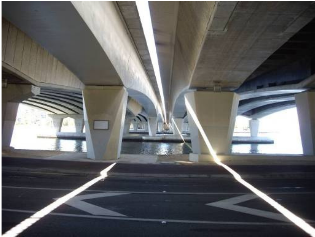
Narrows Bridge Duplication and Rail Bridge