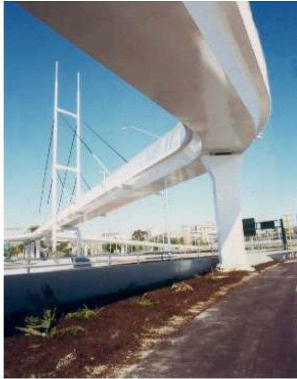
Graham Farmer Freeway, Claisebrook Footbridge