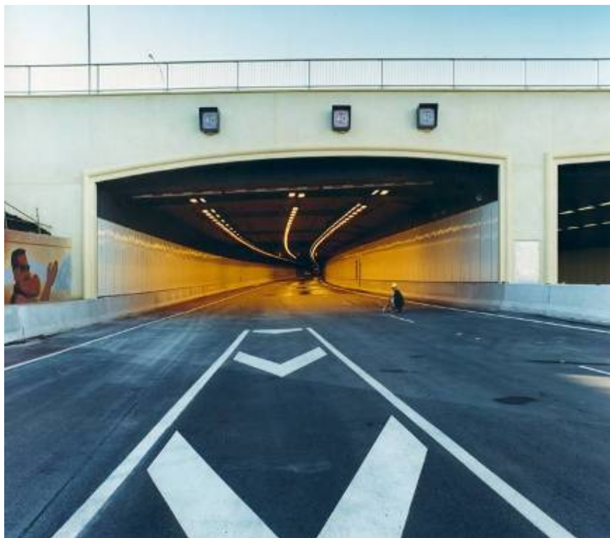
Graham Farmer Freeway and Portals